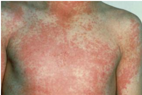
Scarlet Fever Rash

Group A Streptococcus http://www.cdc.gov/getsmart/antibiotic-use/URI/sore-throat.html .